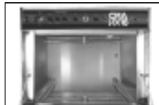
Upper and lower rotating wash arms guarantee excellent results.