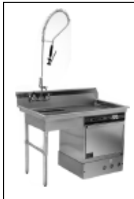
Optional dishtable, faucet and pre-rinse unit sold separately.