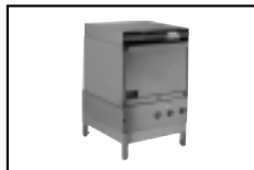
Optional pedestal allows the L-1X16 to be raised up to a full 12" off the floor for easy operator use. Height adjustable from 8" to 12".