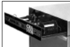
Convenient to service "Works-in-a-drawer", may be removed by unplugging one electrical connection.