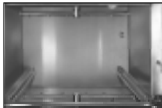
Upper and lower rotating wash arms guarantee excellent results.