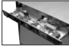
"Works-in-a-drawer". All electrical components are attached to a sliding drawer for easy access and service.