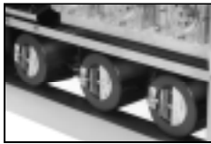
"Built in" hot water assurance system provides hot water every cycle.