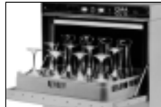
Uses standard 20"X20" racks. Large 11-1/4" glass clearance.